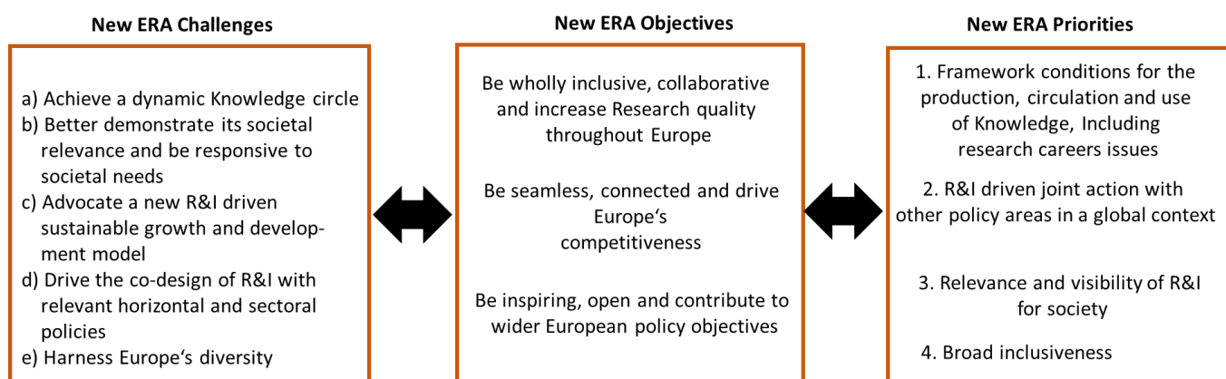
Figure 2: Relationship between the new ERA challenges, objectives and priorities.

Figure 2 illustrates the relationship between the ERA challenges, the ERA objectives and the ERA priorities.