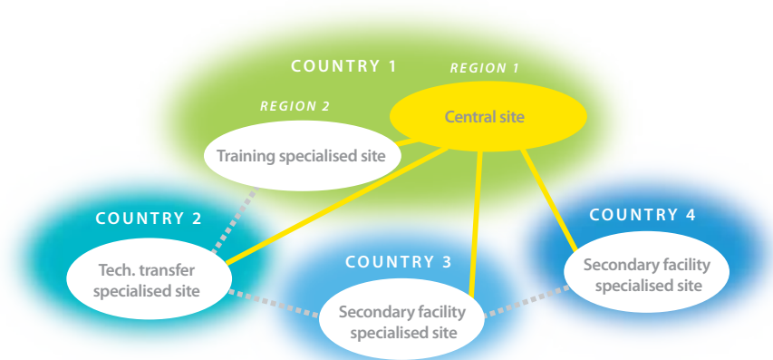
Figure 2: An innovative approach for addressing the site problem