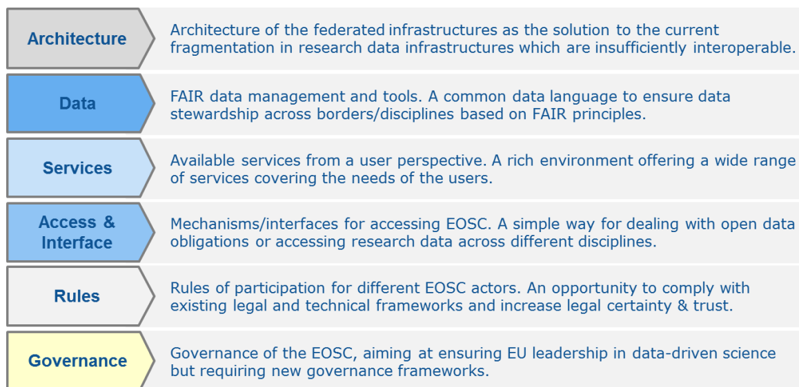
Figure 1 – EOSC Model action lines

The model describes a pan-European federation of data infrastructures built around a federating core and providing access to a wide range of publicly funded services supplied at national, regional and institutional levels, and to complementary commercial services. The model includes six actions lines: (a) architecture, (b) data, (c) services, (d) access and interfaces, (e) rules and (f) governance (Figure 1, below).