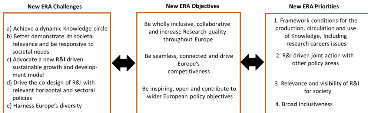
Figure 2: Relationship between the new ERA challenges, objectives and priorities.

Figure 2 illustrates the relationship between the ERA challenges, the ERA objectives and the ERA priorities.